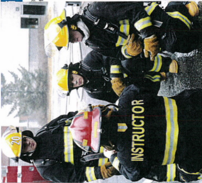
e-Learning Program for First Responders: ngafirstresponder.com

First Responder Natural Gas Safety Training Program