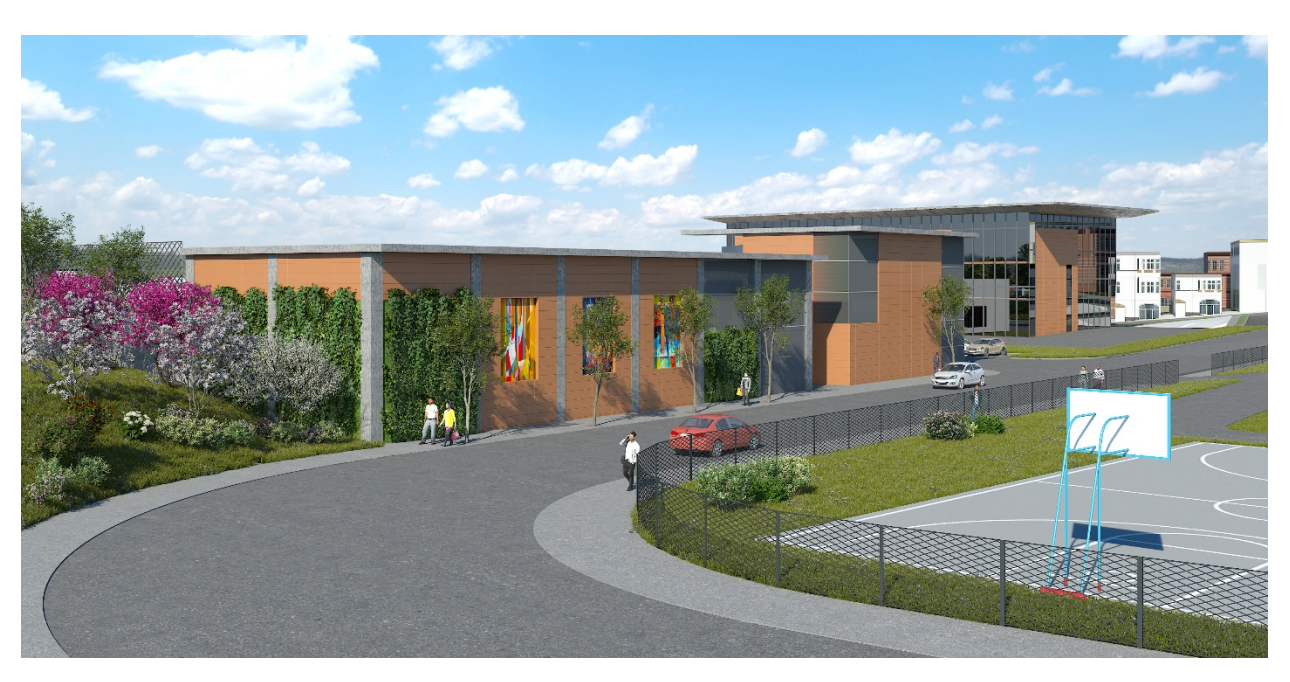
Figure 2: Potential Substation Facade Design Proposed for Community Input

A larger version of this figure is available at the following link: <a href="https://www.mass.gov/doc/east-eagle-update-substation-map/download">https://www.mass.gov/doc/east-eagle-update-substation-map/download</a>.