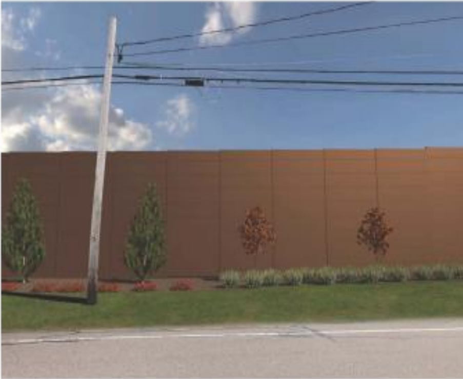
PROPOSED VIEW Generated 2/10/2022