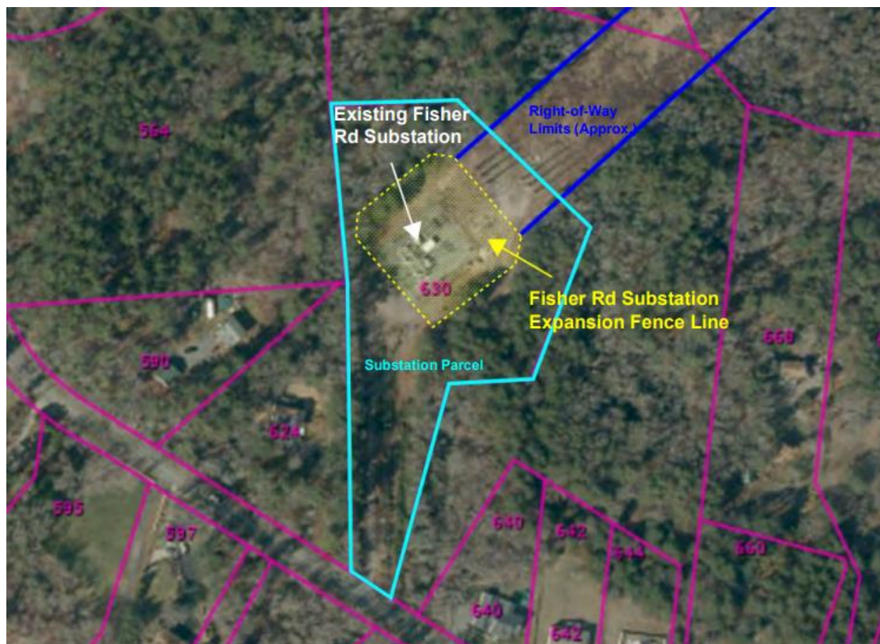
Figure 1: Extent of the proposed expansion, Project parcel boundary, and surrounding parcel boundaries.